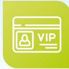
Hosted Buyer Programme